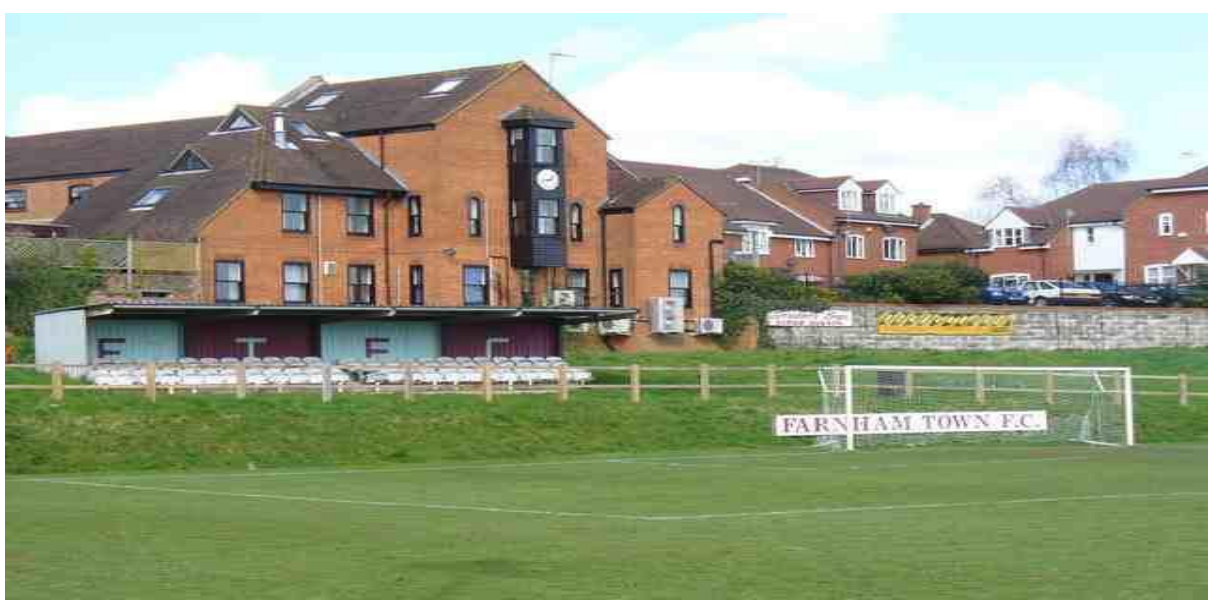
The Enclosure & Stand

Capacity: 1,500 (Seated 60) Team Nickname: Town