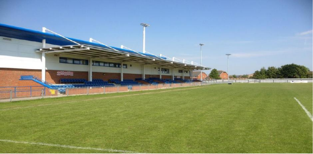
The new Stand at The Gore Ground

Follow this road through the traffic lights, under the railway bridge, over the double mini roundabouts passing the petrol station on your right, past the Brickmakers Arms on the right, past The Pheasant pub on your left, straight through the double roundabouts and then fork right into Wymers Wood Road. Look for the sign Pines Hotel. The entrance to the ground is 50 yards on the right after turning into Wymers Wood Road.